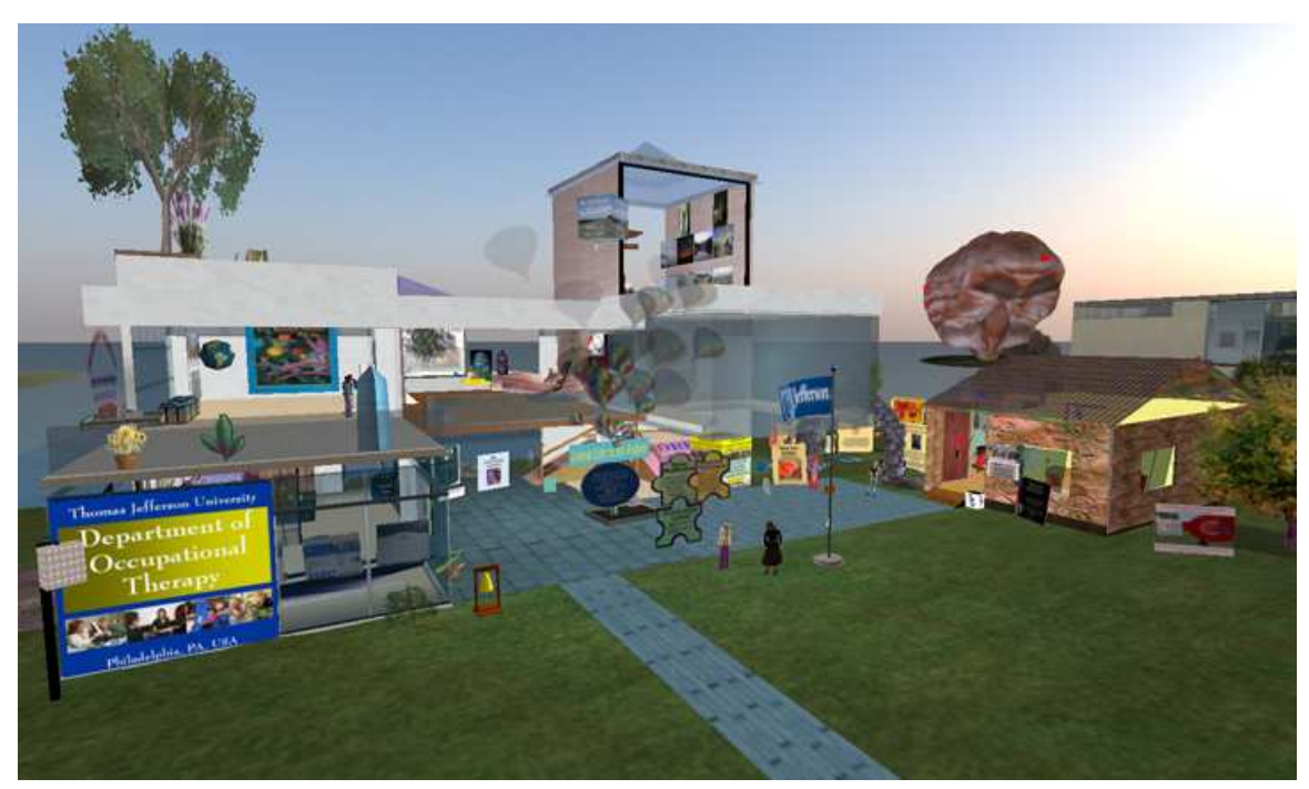
Figure 1: Occupational Therapy Center