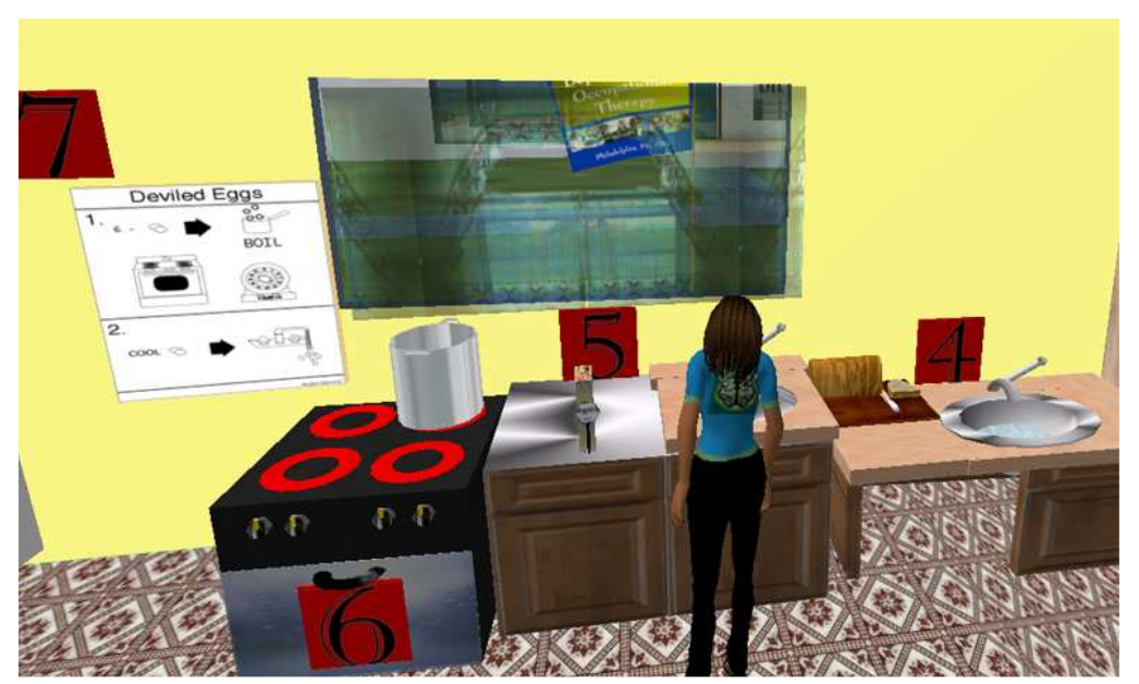
Figure 2: Kitchen of Adapted Home

The adaptation home was set up as a small house within Second Life consisting of an entry way, living room, bathroom, kitchen, and bedroom. Each component of the home exhibit was labeled with a station number (see Figure 2) that provided information about the specific adaptation in local text chat when clicked by the visitor. The home also had objects corresponding to real-life adaptive equipment that visitors could try out, such as a tub seat.