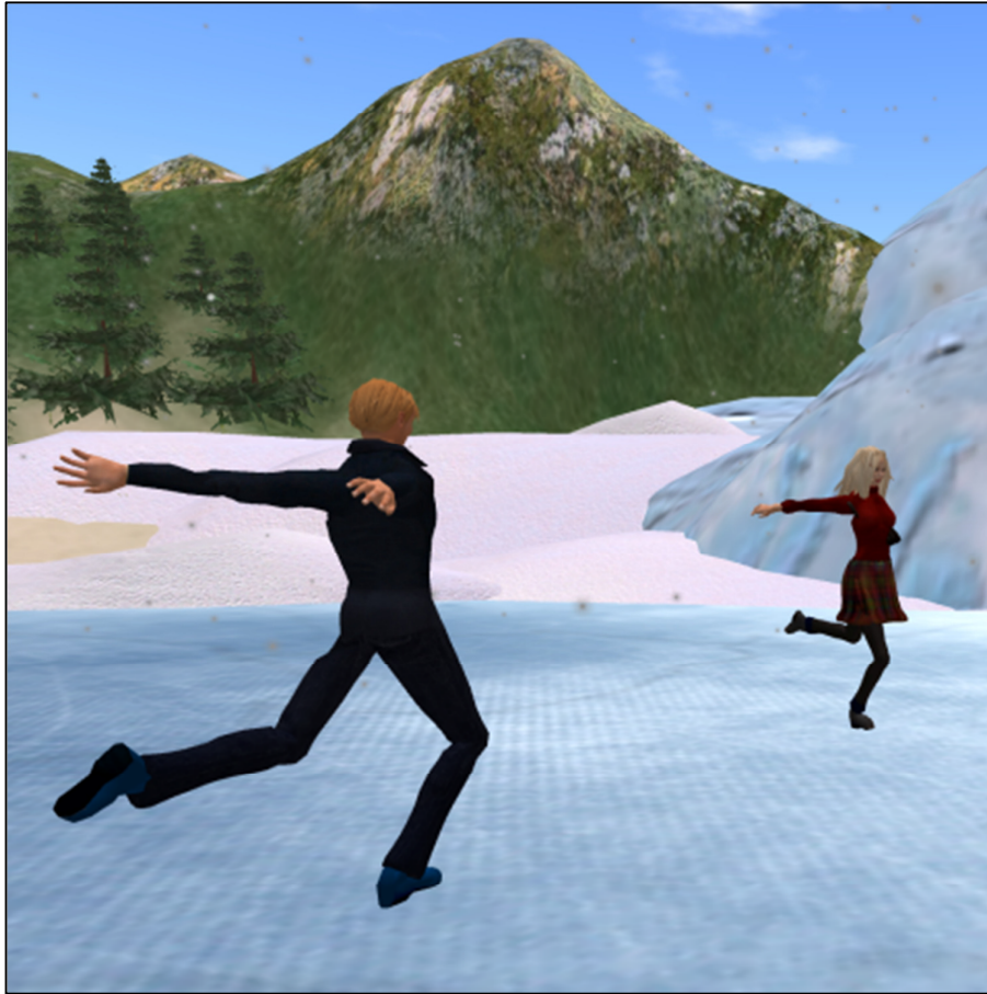
Figure 1: Participants could make their avatars ice skate together in Second Life

Presence: The level of presence refers to the extent to which people experience an artificial environment as being real (Sheridan, 1994). Participants in the present study completed a scale designed to measure the presence they experienced whilst using Second Life, taken from (Fox, Bailenson, & Binney, 2009). See Appendix A for full list of questions that were used.