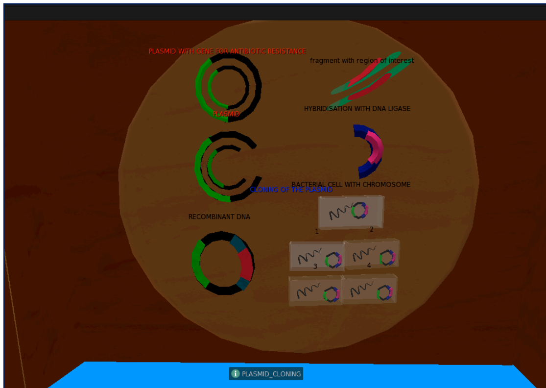
Figure 2: A graphical representation of the steps in bacterial cloning.

The group of five students were given a questionnaire to complete at the end of the process. Three of the five students responded, one female and two male students. Two respondents referred to the module as the “Second Life module” and all three had positive comments for the process. One of the students remarked: