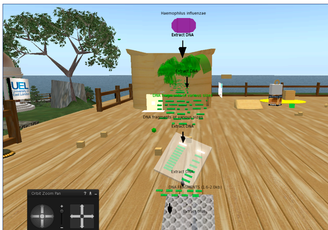
Figure 3: A 3D model of the first stages of a genome sequencing project.

“Learnt (sic) how to create and script in virtual environments. It enhanced my creativity, and presented a new platform to create 3D virtual images, which is a very powerful skills needed in some industries today.”