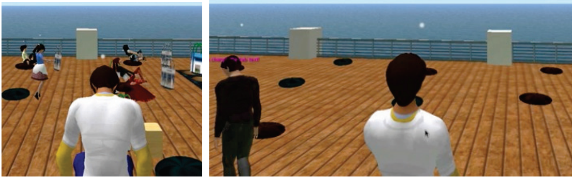
Figure 1(a,b). Screen shots of basic challenges while recording classroom observations in SL. a) Avatar slumping in AFK status, b) recording focused on empty classroom when participants had moved to another area.

person” was not traveling with the class or if the instructor walked to another area or the student avatar traveled out of the view of the observer, the field of view of the observer could be easily obstructed.