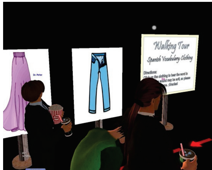
Figure 2. Screen shots of follow chair challenges while recording classroom observations in SL, here the camera person is capturing a view of some participants who are focused on activity taking place to the right that is not captured by this view, which had been set up and left as the optimal view for an earlier activity.

collection so that fewer empty classrooms were recorded, and more fieldtrips were captured; however it became clear that ideally the camera person would be actively focused on the recording process for the entire duration of class movement or field trips. The teaching assistant pulling the follow chair could not see the recording view and so the class’s focus of activity might be missed if the camera person was not actively engaged to focus the recording SL client on whatever happened to be the center of attention (see Figure 2).